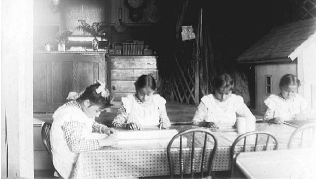
More Photos from Indian Boarding Schools (locations unknown)